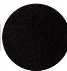
Black Powder, 7g