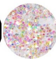
Star Sand Glitter Mix, 7g