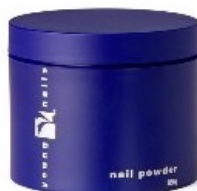
Speed Clear, 85g

Condition the nail with Rose cuticle oil after the cure.