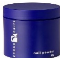
Cover Pink Powder, 85g