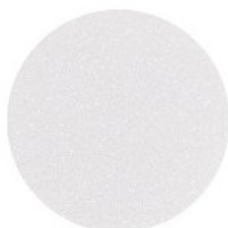
Metallic Pearl Powder, 7g