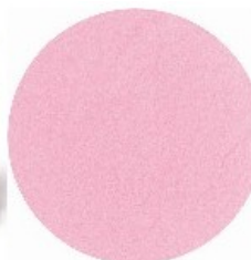
Neon Pink Powder, 7g